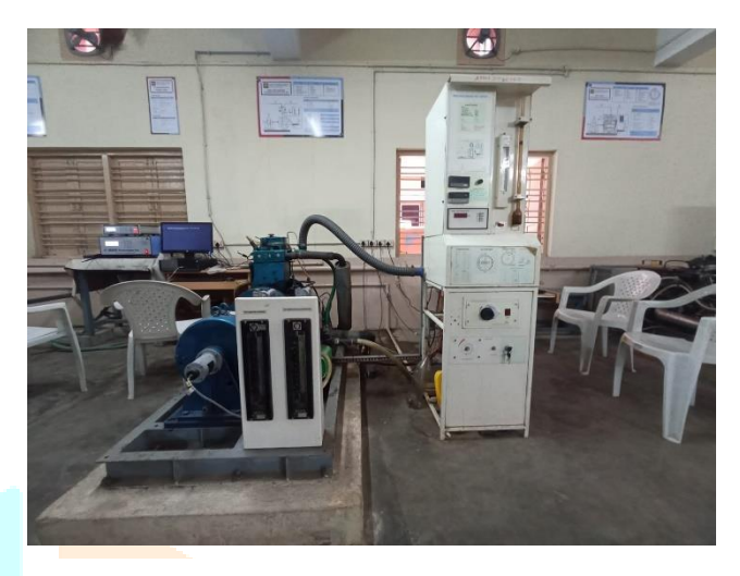
Figure 0-1. Experimental Setup

(BSFC) and brake thermal efficiency (BTE). Combustion characteristics were analyzed using in-cylinder pressure sensors and a data acquisition system to measure ignition delay, combustion duration, and peak cylinder pressure. Emissions of nitrogen oxides (NOx), carbon monoxide (CO), unburned hydrocarbons (UHC), and particulate matter (PM) were measured using an emissions analyzer. The engine was operated on mahua biodiesel and diesel fuel, and emissions were compared to assess the environmental impact of using mahua biodiesel as an alternative fuel. The experimental setup was designed to ensure accurate and repeatable measurements, and all tests were conducted according to relevant standards and guidelines.