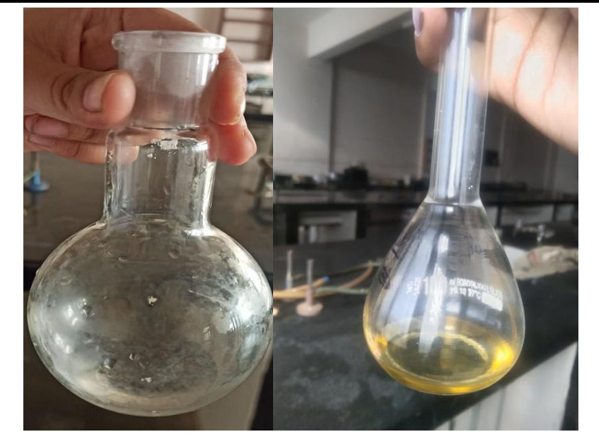
Fig. Before acidic degradation