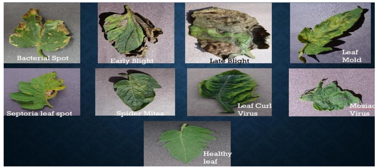
FIGURE 1. Sample images for each class of tomato disease. (a) Bacterial spot, (b) Early blight, (c) Late blight, (d) Leaf mold, (e) Septoria leaf spot, (f) Spider mites, (g) Leaf curl virus, (h) Mosaic virus, (i) Healthy leaf.

Plant disease identification is an important and useful task in agriculture since the early detection of diseases prevents the spread of the disease and finally the loss of the products [1]. Tomato, a nutrition-rich plant with a high source of income for farmers, is one of the most widely grown plants worldwide. However, various tomato plant diseases observed on leaves affect the products in terms of quantity and quality, and therefore, decrease productivity. Some well-known diseases of tomato leaves includeTarget spot, Yellow leaf curl virus, Healthy leaf, Leaf Mold, Spectoria leaf spot, Spider mites two spotted spi, Bacterial spot, Mosaic virus, Early Blight, Late Blight, as shown in Figure 1.