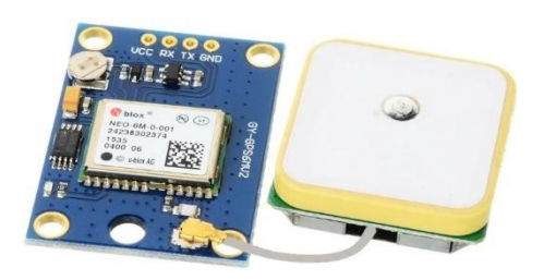
Figure 3. GPS module

GPS (Global Positioning System) is a network of satellites that provides location and time data anywhere on or near Earth, regardless of weather conditions. This system currently consists of 24 satellites strategically positioned in orbit, traveling at impressive speeds. To pinpoint a location on Earth, a GPS receiver needs data from at least three satellites. Often, a fourth satellite is used to cross-check the information and increase accuracy. Technological advancements have led to compact GPS modules with built-in processors and antennas. These modules receive and interpret satellite signals, allowing them to determine your position and the precise time.