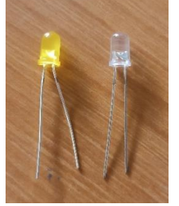
Fig 5: DC Bulb, LED

DC light bulbs are good for remote and self-standing power supplies, such as DC batteries, LEDs.