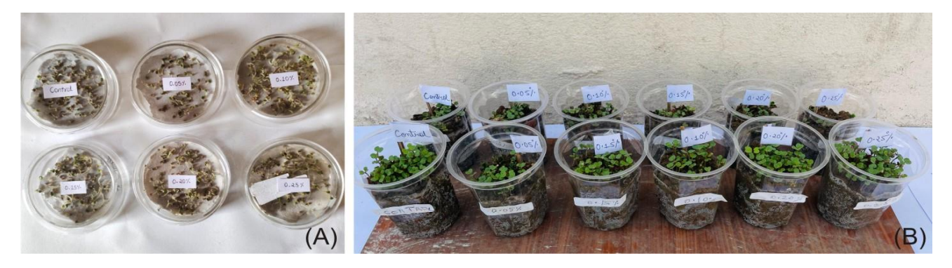
Fig. A- Petridish showing seed germination at different doses of EMS

Physiologically similar seeds of Brassica campestris NL-360 were exposed to a chemical mutagen ethyl methane sulphonate (EMS). Seeds were treated with EMS concentrations of 0 (control), 0.05%, 0.10%, 0.15%, 0.20%, 0.25% for 24Hrs. After completion of treatment the seeds were thoroughly washed in running water 2-3 times to remove the excess mutagen stick to the seed coat. (4) 50 percent seeds of each dose along with control were kept in petridishes on blotting paper in triplicates. The emergence of radical was taken as indication for germination of seed. Total Germination percentage was calculated after eight days by counting the germinated seeds and total number of seeds sown. The experiment was established at the field of Basic and Applied Sciences, Sangam University, Bhilwara (Rajasthan). Germination percentage was recorded for each dose at 10 DAG, 20 DAG and 30 DAG.