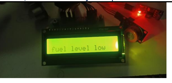
Fig. 4 If fuel level is low