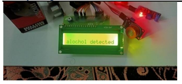
Fig. 3 If alcohol detected