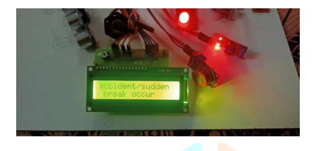
Fig. 5 Accident/sudden break occur