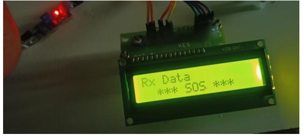
Fig. 10 RX data SOS