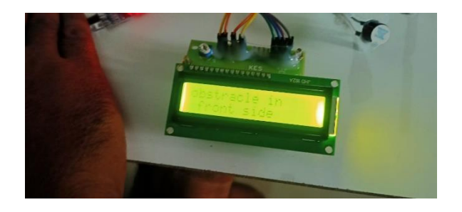
Fig. 6 Obstacle in front side