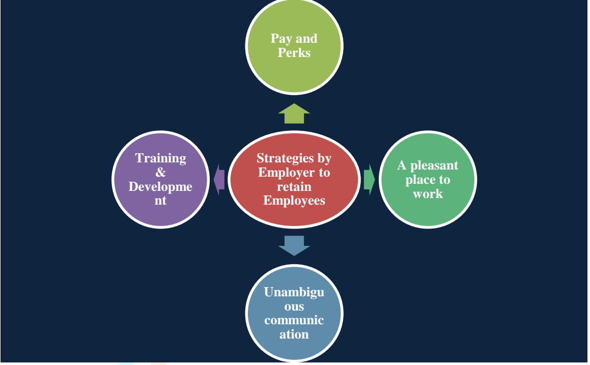
Figure-Strategies by employer to retain employee