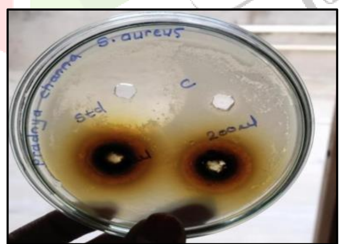
Figure 2: ZOI of P. gaujava extract for S.Aureus

2. Antifungal activity against <u>Candida albicans</u>: (Agar well plate diffusion Method) Well diffusion method for the determination of zone of inhibition Antifungal activity: