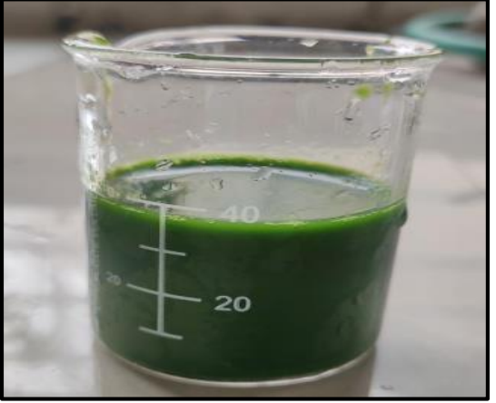
Figure 4: Neem juice

Preparation of neem juice: First, take fresh and whole neem leaves. Then wash it with distilled water and dry it a little. Place the leaves in a blender and add the required amount of water. Blend until you get a smooth consistency. Use a muslin cloth to strain the mixture.<sup>[17]</sup>