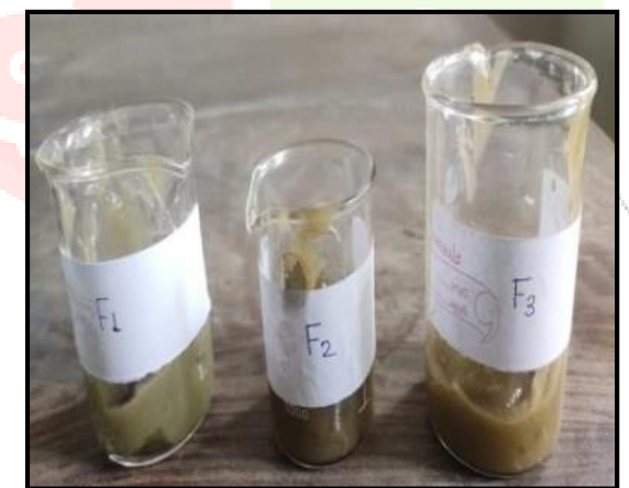
Figure 6: Formulation of Hair Gel

Finally, add the remaining ml of formulation and triethanolamine drop by drop until the pH becomes neutral and the gel reaches the required composition.<sup>[1]</sup>