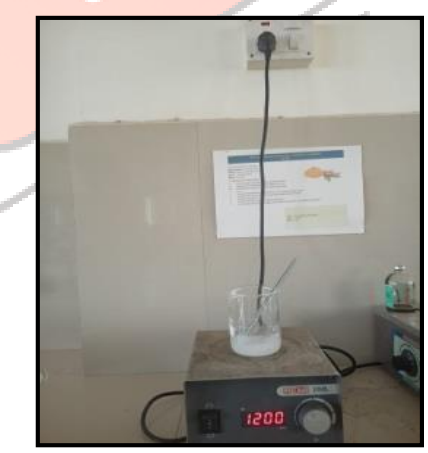
Figure 7: Mixing of Hair Gel