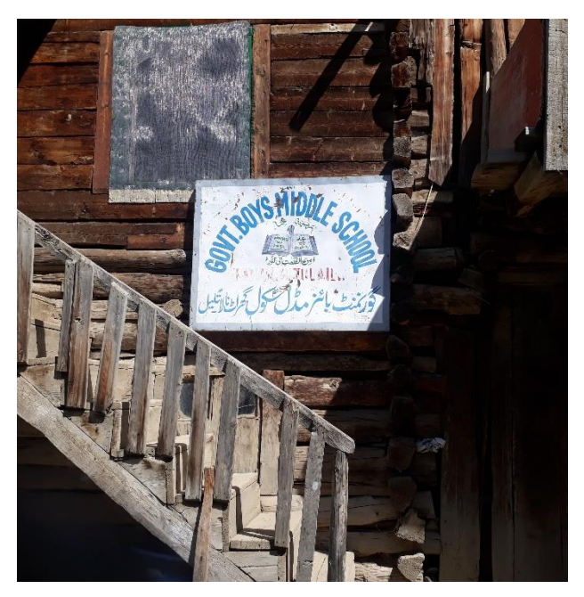
Figure 2 Govt, Upper Primary School Gratnala Tulail