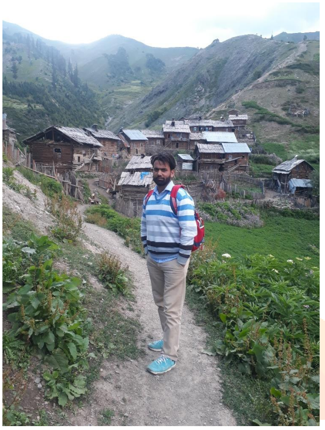
Figure 1 Investigator while data collection at habitation Refugee II, Kilshay Tulail