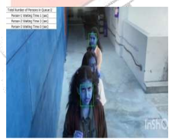
Figure 2: Face Recognition 2) Gray Scale Conversion After get image acquired by open-cv this color image further converted into a gray scale by reducing noise. Gaussian

The Image acquisition is the process of collecting input image sample. The component collects scenes containing objects of interest in the form of images. Here, generally system webcam is used for image acquisition. We use Python, Open-CV, face recognition library and piquet to make our very own image detector. We are working with all image operations by using open computer vision python library. It is an Open source Computer Vision and a machine learning software library which is a common infrastructure for computer vision applications and to accelerate the use of machine perception. The use of OpenCV in this system is to process the image, remove the noise and extract the required information from the image, creating them as the boundary boxes.