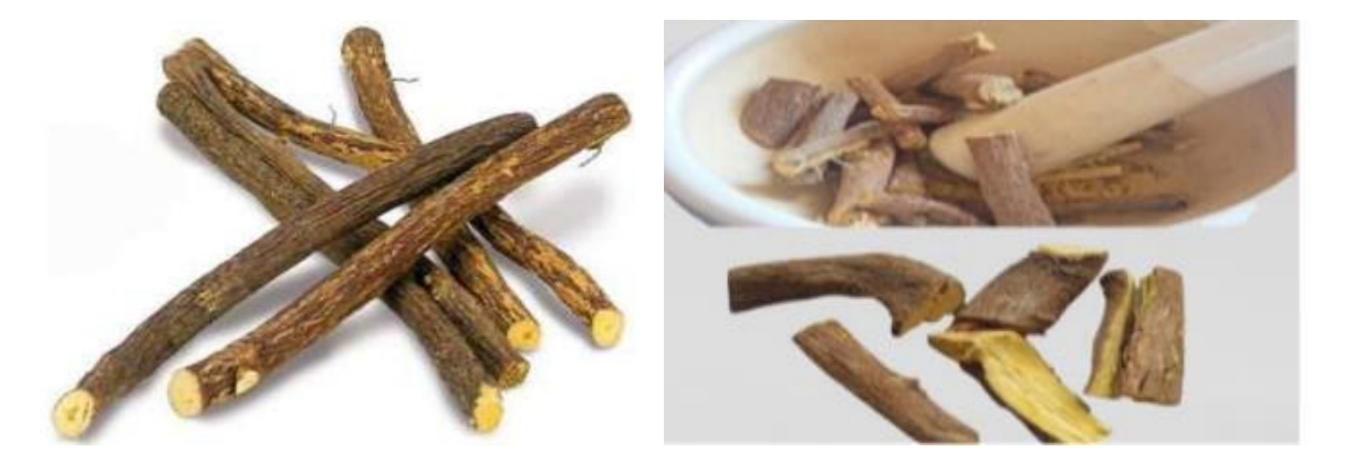
Fig 14: Liquorice

Mechanism of action: Liquorice's mechanism of action involves anti-inflammatory and mucosal protective actions. Glycyrrhizin produces inflammation, while other compounds promote mucin production, forming a protective layer. These actions may contribute to soothing effects, aiding in the healing and alleviation of discomfort associated with mouth ulcers.