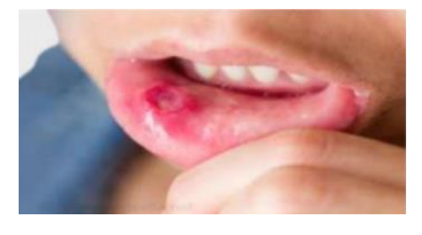
Figure 3: Major Ulcer

Herpetiform ulcers: Herpetiform ulcers, the third category, is a term that refers to the clustered appearance of lesions. This ulcer consists of a cluster of dozens of tiny lesions the size of pinheads. It has nothing to do with the herpes virus. These appear in enormous numbers, ranging from 10 to 100 at a time, and are made up of several tiny lesions that eventually join to form larger plaques. They may heal with a scar in 7 to 30 days depending on the size and depth of the ulcer. 21