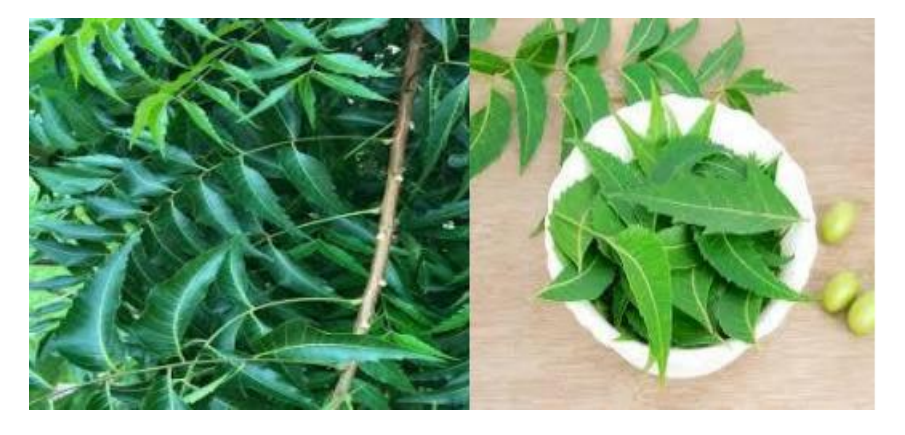
Fig 11: Neem

Mechanism of action: They improve the immune response in gum and tissue of the mouth, which are good remedies for mouth ulcers. Neem leaves act as pain reliever in mouth ulcer and toothache problems. Neem contain azadirachtin, nimbin, nimbidin, nimbolide, have antibacterial effect. Neem inhibit the growth of bacteria and fungi Neem leaves show anti-inflammatory effect. Neem leaves play an important role in wound healing by tensile strength of the healing tissue. Azadirachta indica leaf extracts stimulates wound healing by triggering an inflammatory response and neovascularization.