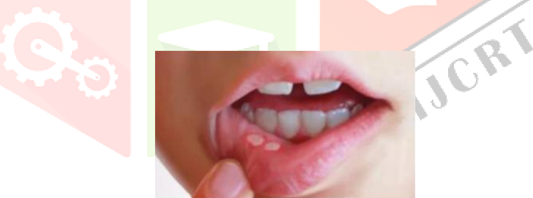
Figure 1 : Minor ulcer

Minor ulcers: Minor aphthous ulcers are the most frequent type, accounting for around 80% of occurrences. These are approximately 2-8 mm in diameter and usually clear up in 10 to 2 weeks. These ulcers are often superficial, small in size (less than 1.0 cm in size), few in number, occur alone or in clusters, and heal without scarring.