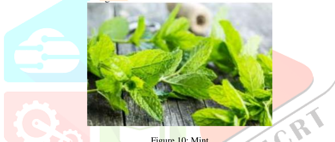
Figure 10: Mint

Chemical constituents: Vitamin A, Vitamin C, Iron, Calcium, Magnesium.