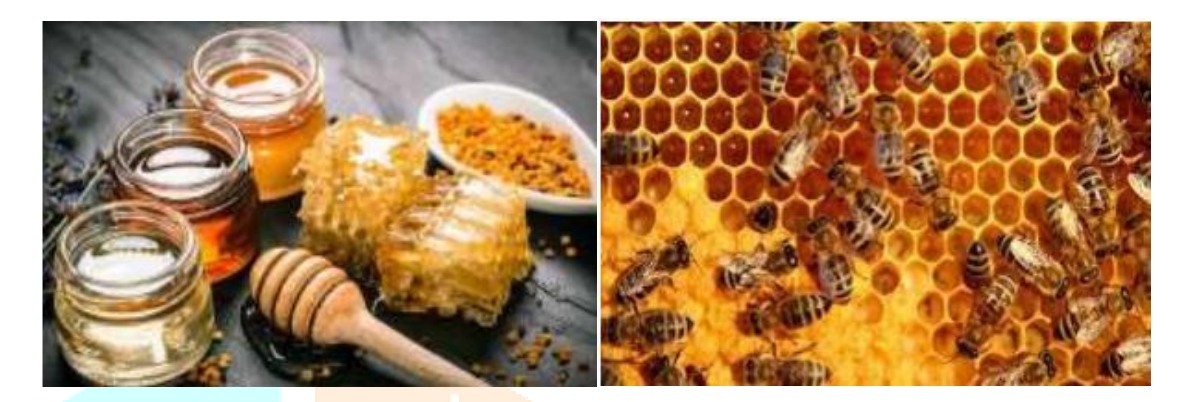
Figure 8: Honey

Chemical constituents: Glucose, Fructose, Sucrose, dextrin, formic acid, protins, enzymes, vitamins.