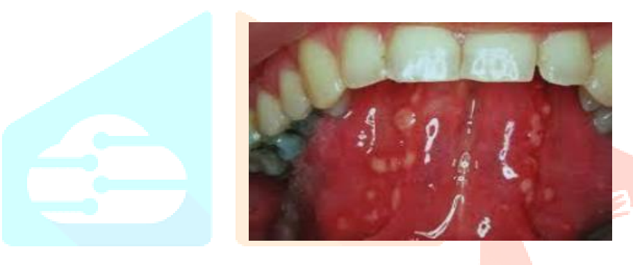
Figure 4: Herpetiform ulcer

Herpetiform ulcers: Herpetiform ulcers, the third category, is a term that refers to the clustered appearance of lesions. This ulcer consists of a cluster of dozens of tiny lesions the size of pinheads. It has nothing to do with the herpes virus. These appear in enormous numbers, ranging from 10 to 100 at a time, and are made up of several tiny lesions that eventually join to form larger plaques. They may heal with a scar in 7 to 30 days depending on the size and depth of the ulcer. 21