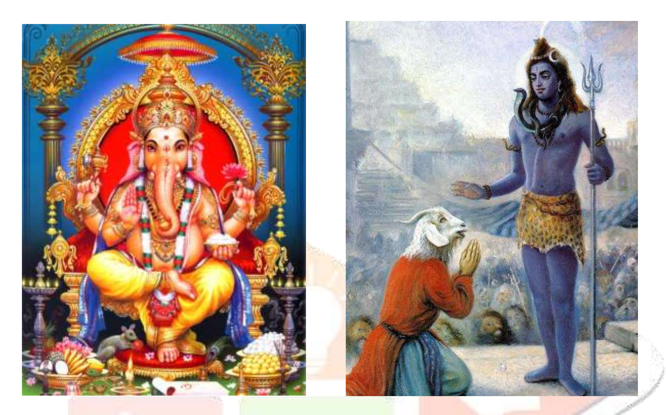
[Fig.1 Lord Ganesha; Fig. 2 Lord Shiva (right) and Prajapati Daksh (left)]

Hinduism highlights the mythological traces of Xenotransplantation and that for millions of years back, people have been fascinated by the idea of merging the distinctive features of different species of animals.[10] Hindu mythology states that Lord Ganesha, who is also known as the God of Transplantation, was given the elephant's head after his father, Lord Shiva accidentally decapitated it.[11](Fig.1) Likewise Father-in-law of Lord Shiva, Daksha was beheaded by the incensed Lord Shiva, whose head was then thrown into the yajna .Later, after diminishing all of his rage, Lord Shiva gives Daksh a goat's head transplant. [12](Fig.2)