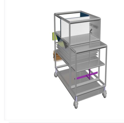
Fig 8. Internal functionality isometric side view

The extra leftover powder can be taken out with the stencil and refilled in the rice powder container. This ensures that the machine is always ready for use and that users do not have to worry about running out of powder.