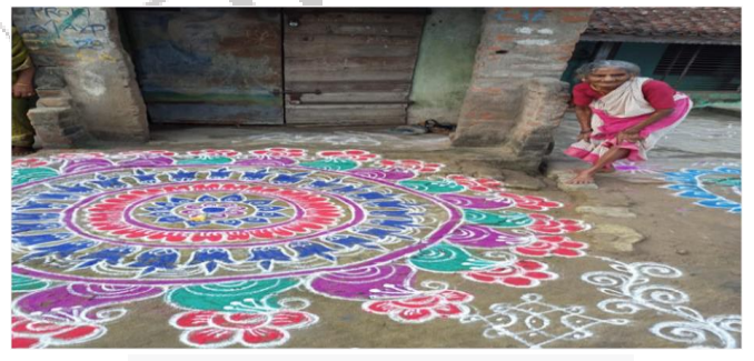
Fig 3. Traditional kolam / rangoli

Overall, the existing system of making rangoli involves using dung water and rice powder, which can be time-consuming and potentially hazardous to health. The DoorSprakle+ Homecare Assistant is a revolutionary machine that simplifies the daily routine of South Indian women, allowing them to focus on other important tasks. With its ease of use, cost-effectiveness, and environmental benefits, DoortSparkle+ Homecare Assistant is a must-have for every household. It not only saves time and effort but also ensures that the traditional art form of kolam / rangoli is preserved for future generations.