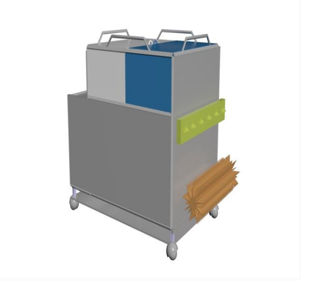
Fig 4. Doorsparkle+ Homecare Assistant overall view

Overall, the 3-in-1 Multi-functional DoorSprakle+ Homecare Assistant has the potential to improve the quality of life for South Indian households by providing a convenient and affordable solution to routine household chores. By saving time, money, and effort, the machine can help individuals focus on other important tasks and activities, improving their overall well-being. The proposed system is a costeffective and efficient solution that can be easily integrated into the lives of individuals seeking convenience and time optimization