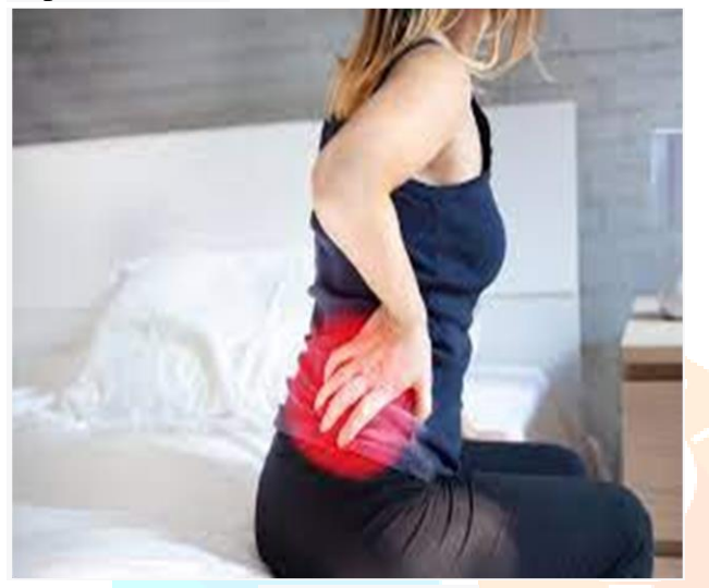
Fig 1. Hip pain

To address these challenges, the DoorSprakle+ Homecare Assistant was introduced, which is a revolutionary machine that combines the functions of sweeping the door, sprinkling water, and creating kolam designs using a stencil. The machine is designed to simplify the daily routine of South Indian women, allowing them to focus on other important tasks.