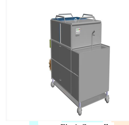
Fig 6. Controller

The controller handles everything through the motor and switches. This ensures that the machine is easy to use and operate. The motor ensures that the machine runs smoothly and efficiently, while the switches allow users to control the various functions of the machine. DoortSparkle+ Homecare Assistant is a game-changer in the world of rangoli design.