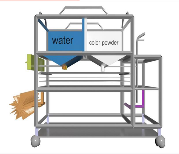
Fig 7. Internal functionality side view

On the other hand, when the user lifts up the lever/switch, the powder will travel from the rice powder container to the bottom layer of the stencil tray. This ensures that the powder is evenly distributed and ready for the kolam design to be created. When the wiper switch is turned on, it will wipe the powder from the front and back. This ensures that the design is clean and free of any excess powder.