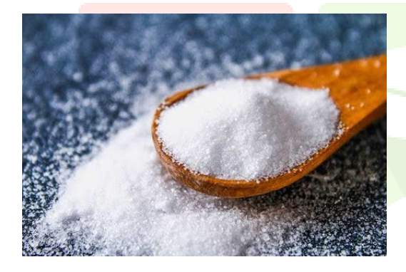
Fig :- Sodium Lauryl Sulfate