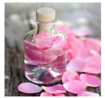
Fig :- Rose Water