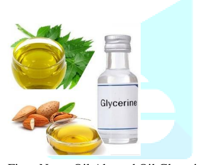
Fig :- Neem Oil, Almond Oil Glycerine

Selection and Collection of herbs: - The herbs for a Researched were selected on the basic of brief Literature review and surfing of general and Publication. Neem oil, pure almond oil, rosewater, Aloe Vera gel are selected for the development of paper soap.