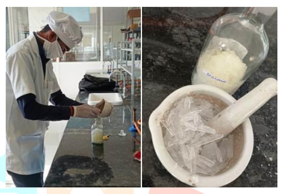
Figure 7: Formulation Of Herbal Pain Reliever balm

When all the added ingredients were completely dissolved and turn in to the liquid form then take the solution out of the hot plate and keep the herbal balm solution for cooling. Finally the prepared solution cools down and turns into a semi solid herbal balm.