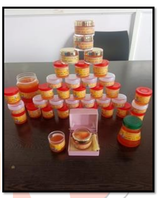
Formulation of Anti-inflammatory Herbal Balm