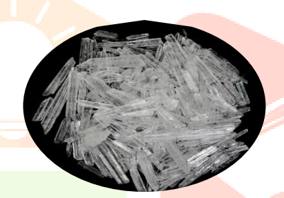
Figure 4: Menthol

Menthol provides a cooling sensation when applied to the skin, which helps relieve pain in the tissues underneath the skin. Menthol topical (for use on the skin) is used to provide temporary relief of minor arthritis pain, backache, muscles or joint pain, or painful bruises. Menthol improves blood flow to the skin wherever it is applied, bringing life back to dull and tired complexions. Additionally, it reduces the production of inflammatory cytokines and prostaglandins to help improve red and inflamed skin.