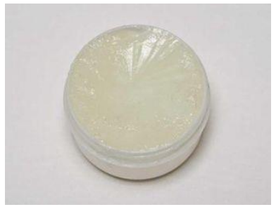
Figure1: Petroleum jelly