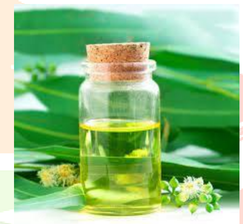
Figure 6: Eucalyptus oil