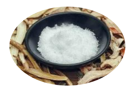
Figure 3: Camphor