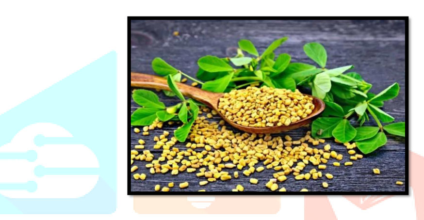
figure- fenugreek seeds

Various plant compounds in fenugreek may interact with a chemical in the body that is known as DHT (dihydrotestosterone). If DHT attached itself to your hair follicles, the result, sooner or later, would be hair loss. Fenugreek may slow down the ability of DHT to attach to your hair follicles.