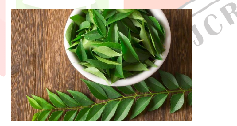
figure- curry leaves

Curry leaves are commonly known as 'KadiPatta'. It is one of the most common household ingredients which are easily found in most Indian kitchens.