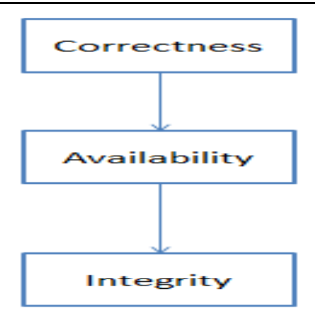
Fig: Task Network