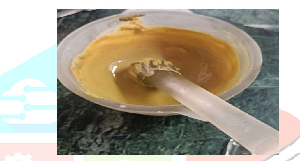
Figure 5: Formulation of Lotion