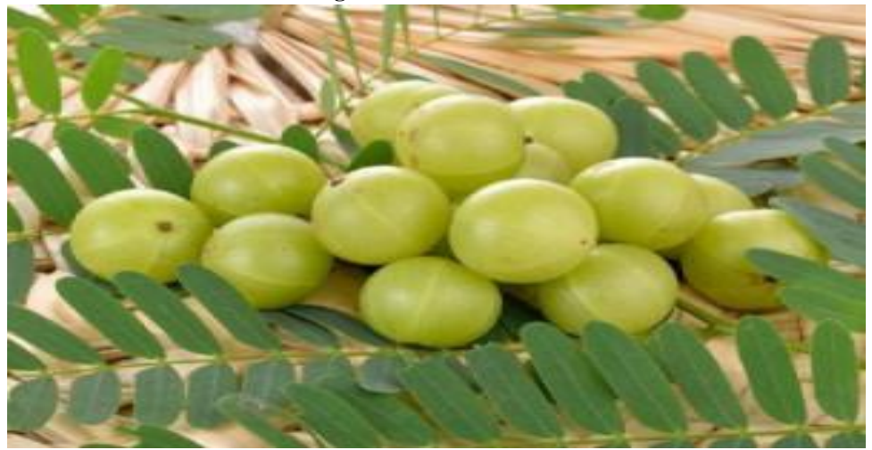
Figure 3: Plant of Amla