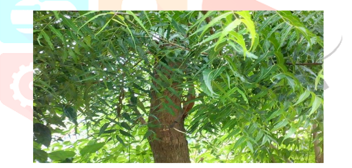
Figure 2: Plant of Neem

3. Plant materials: Azadirachta Indica leaves & Phyllanthus Emblica were collected from a plantation.