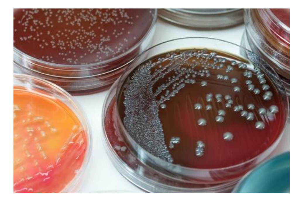
Figure 6: Culture media preparation

5.4 Total Viable Count Tests: To determine the microbiological specification of the finished cosmetic product, measurement of the total count of aerobic mesophilic microorganisms as well as yeasts and fungi is required with comparison against industry established allowable limits. Our microbiology teams deliver robust testing services to help you understand the microbiological cleanliness of your products and support the release of your batches in accordance with the standards ISO 16212 (Enumeration of yeast and mould), ISO 21149 (Enumeration and detection of aerobic mesophilic bacteria).