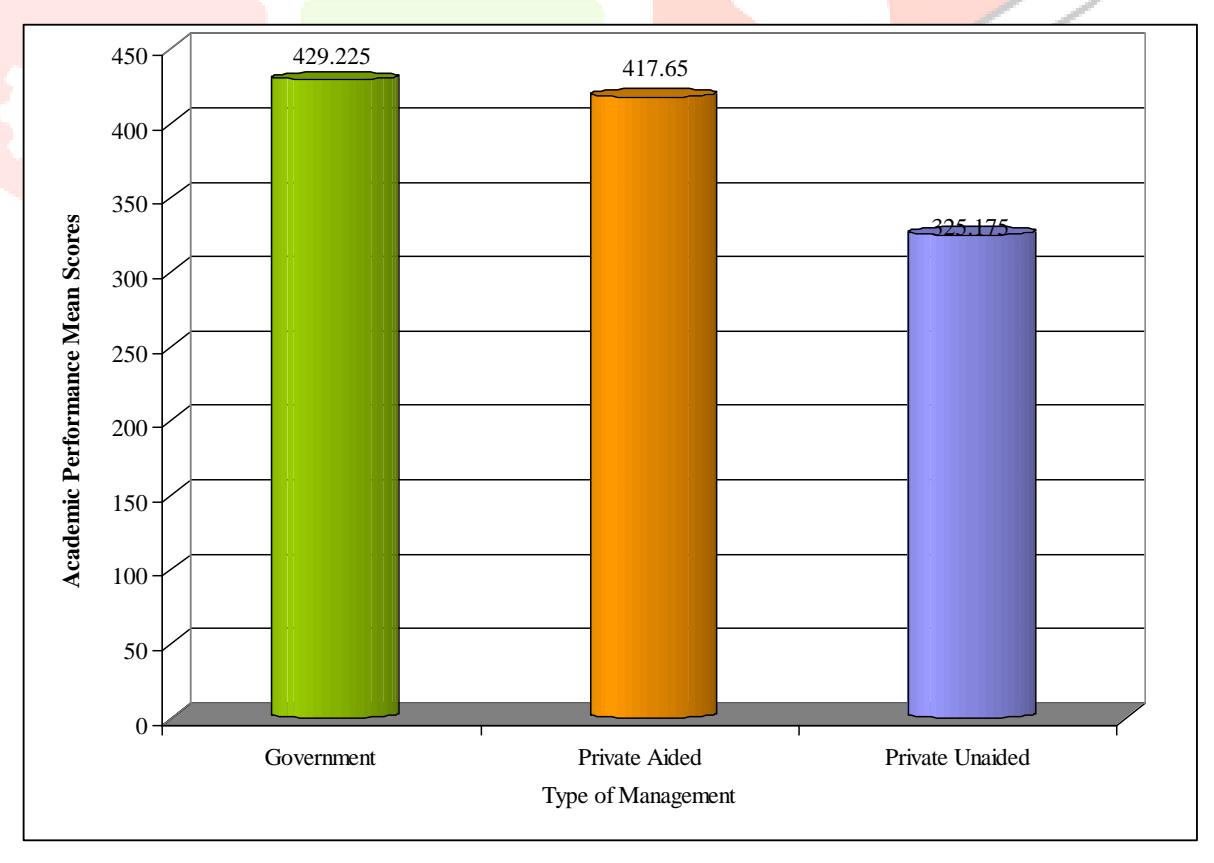
Figure No.-2 : Showing the mean scores comparison of Academic Performance of secondary school students studied in government, private aided and private unaided schools.

The same result was represented in graphical presentation in Figure No.-2.