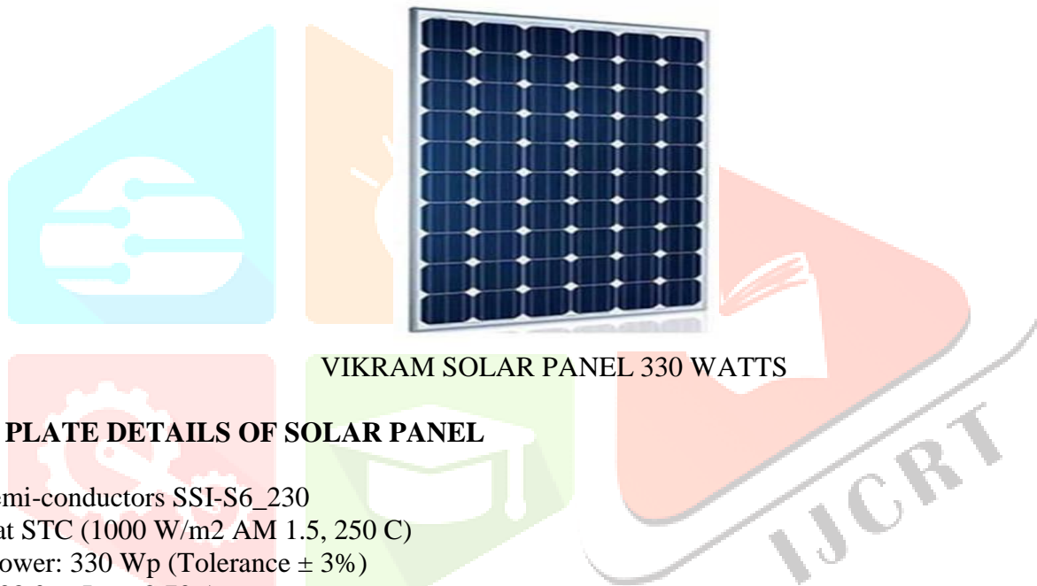
VIKRAM SOLAR PANEL 330 WATTS

Total No. Of panels installed is: 213 Numbers.