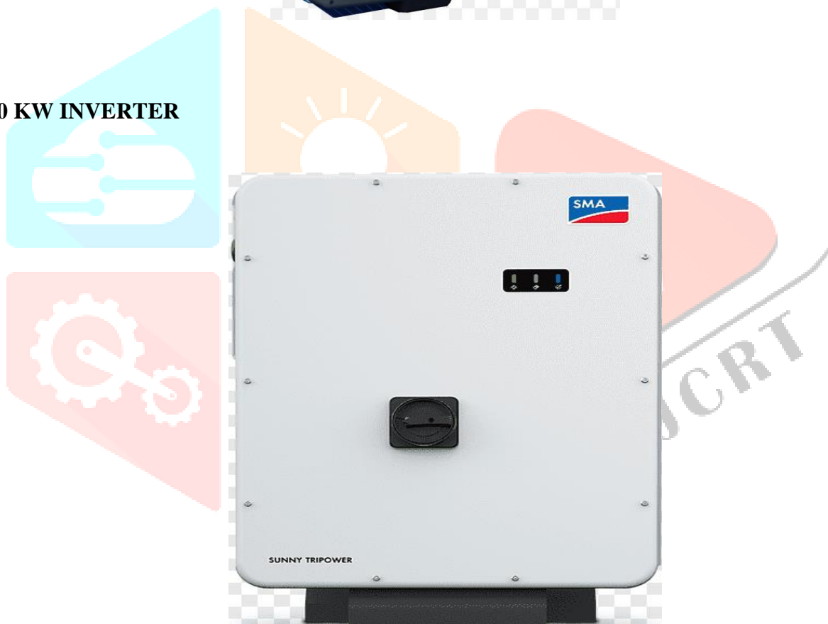
FIGURES OF 20 KW AND 50 KW INVERTERS (SMA COMPANY MAKE)

The DC supply from solar panel through maximum PowerPoint track (MPPT) to the AJB1, AJB2, AJB3, AJ4 Junction boxes. These boxes are connected to the cable of supply terminal and DC supply from solar panels comes in to the power conditioning unit through the cable.