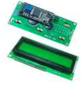
Fig 3: LCD display16X2

Lcd Display: LCD (Liquid Crystal Display) is a type of flat panel display which uses liquid crystals in its primary form of operation. LEDs have a large and varying set of use cases for consumers and businesses, as they can be commonly found in smartphones, televisions, computer monitors and instrument panels. LCDs were a big leap in terms of the technology they replaced, which include light-emitting diode (LED) and gas-plasma displays. LCDs allowed displays to be much thinner than cathode ray tube (CRT) technology. LCDs consume much less power than LED and gasdisplay displays because they work on the principle of blocking light rather than emitting it. Where an LED emits light, the liquid crystals in an LCD produces an image using a backlight. As LCDs have replaced older display technologies, LCDs have begun being replaced by new display technologies such as OLED