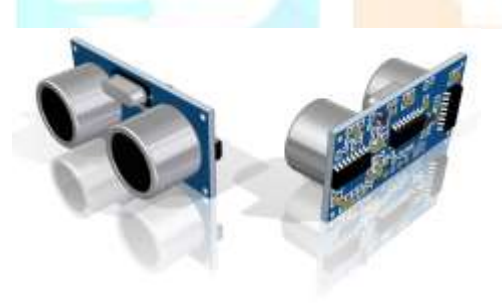
Fig 2: Ultrasonic sensor module

The HC-SR04 Ultrasonic Distance Sensor is an inexpensive device that is very useful for robotics and test equipment projects. This tiny sensor is capable of measuring the distance between itself and the nearest solid object. The HC-SR04 can be hooked directly to an Arduino or other microcontroller and it operates on 5 volts. This ultrasonic distance sensor is capable of measuring distances between 2 cm to 400 cm. It's a Ultrasonic sensors release short, high-frequency sound pulses are emitted by Ultrasonic sensor's transmitter at regular intervals. They travel in the air at the speed of sound. Once the sound pulse strikes an object, it is reflected back as echo signals and spent by the sound to be transmitted and bounced back to the receiver.