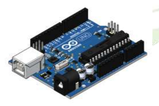
Fig 4: Arduino UNO

It is an open-source electronics platform. It consists ATmega328 8-bit Microcontroller. It can be able to read inputs from different sensors & we can send instructions to the microcontroller in the Arduino. It provides Arduino IDE to write code & connect the hardware devices like Arduino boards & sensors. In 2019, Arduino released the Arduino Nano Every, a pin-equivalent evolution of the Nano. It features a ATmega4809 microcontroller (MCU) with three times the RAM The Arduino Nano has a number of facilities for communicating with a computer, another Arduino, or other microcontrollers. The ATmega328 provides UART TTL serial (5V) communication, which is available on digital pins 0 (RX) and 1 (TX). An FTDI FT232RL on the board channels this serial communication over USB and the FTDI drivers (included with the Arduino firmware) provide a virtual com port to software on the computer. The Arduino software includes a serial monitor which allows simple textual data to be sent to and from the Arduino board. The RX and TX LEDs on the board flash when data is being transmitted via the FTDI chip and the USB connection to the computer (but not for serial communication on pins 0 and 1). A Software Serial library allows for serial communication on any of the Nano's digital pins. The ATmega328 also supports I2C and SPI communication. The Arduino software includes the Wire library to simplify use of the I2C bus.