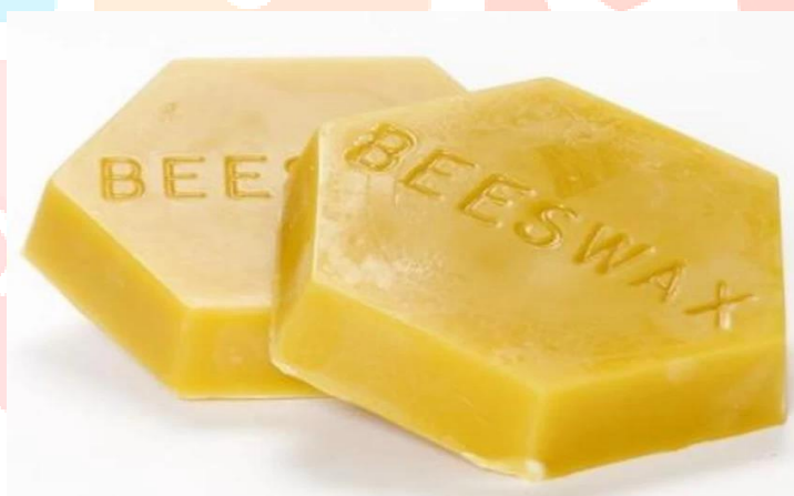
Fig no. 4: Beeswax