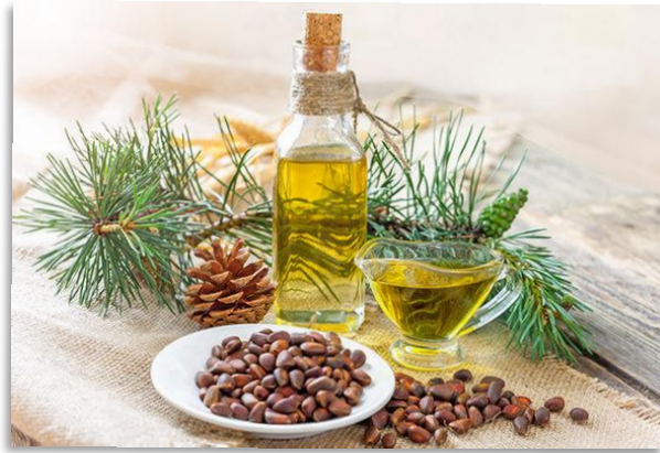
Fig no. 7: Cedarwood essential oil