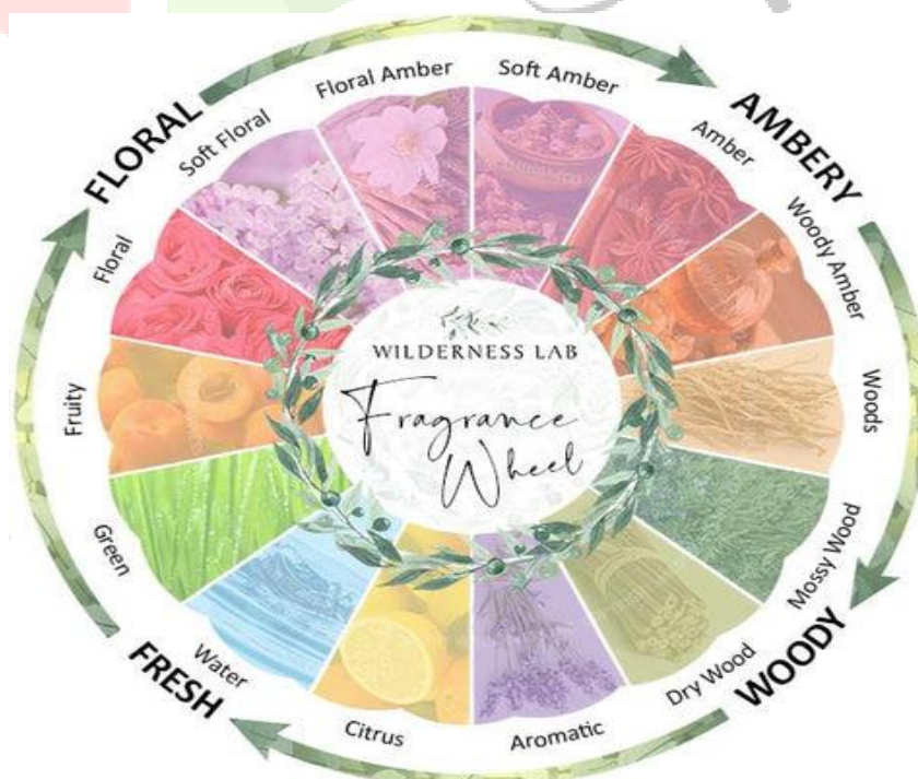
Fig no.2: Fragrance wheel [8]