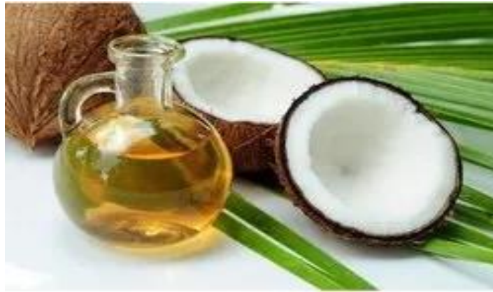
Fig no. 5: Coconut carrier oil