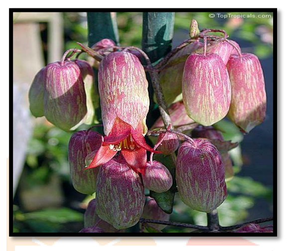
Flowers of Bryophyllum pinnatum

Flowers: - The Flowers are red-orange flowers. The calyx is made up of a long tube that is red at the base and has four tiny triangular lobes at the end that are veined with yellowish green (or green dotted with reddish brown). The tubular corolla, which has four lobes that reach a length of 5 cm (2.0 in), is ended by a strong constriction that divides the subspherical part of the ovoid part. It has streaks of reddish-purple tint and a yellowish hue. The corolla is fused to the eight stamens, which are roughly 4 cm (1.6 in) long and arranged in two whorls. The ovary consists of four thin-styled carpels that are somewhat joined together in the middle. (4)