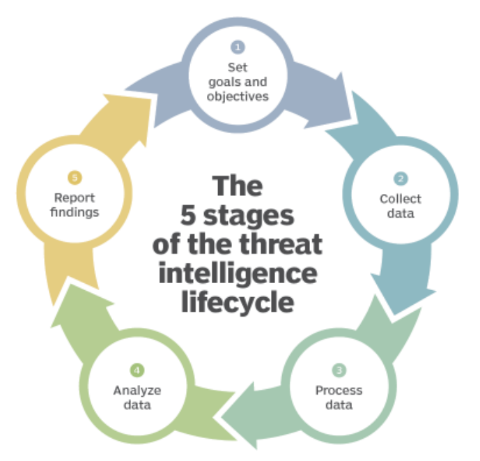
Fig 3. Threat Intelligence stages

Decision-Making: Utilize a centralized decision-making system that integrates outputs from intrusion detection, malware analysis, and threat intelligence. Consider explainability and transparency in decision-making processes.