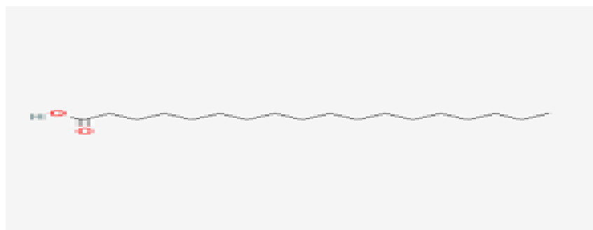
Table No.1: Properties of stearic acid