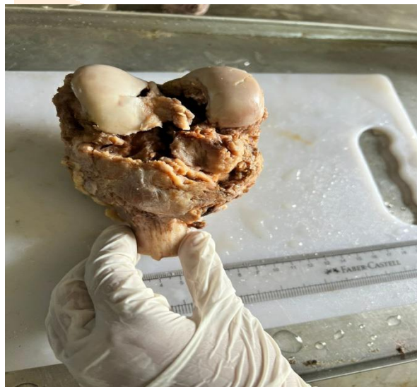
Photograph – 2: Bone specimen of distal femur proximal tibia.