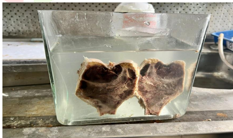
Photograph – 3: Cut surface with brownish areas.