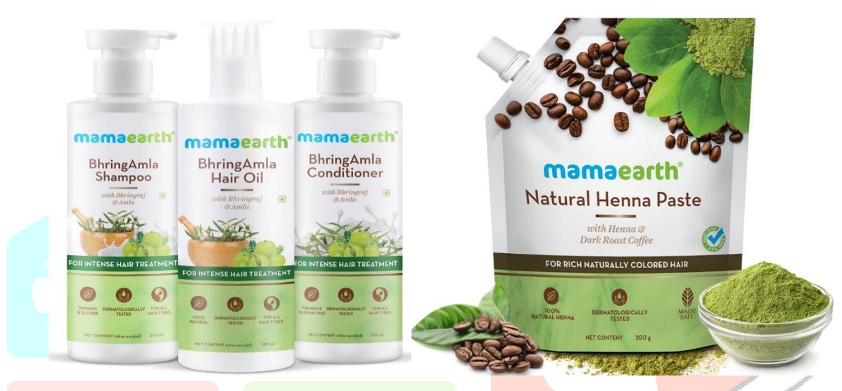
FIG.4. MARKETED PREPARATION OF HERBAL HAIR COSMETICS