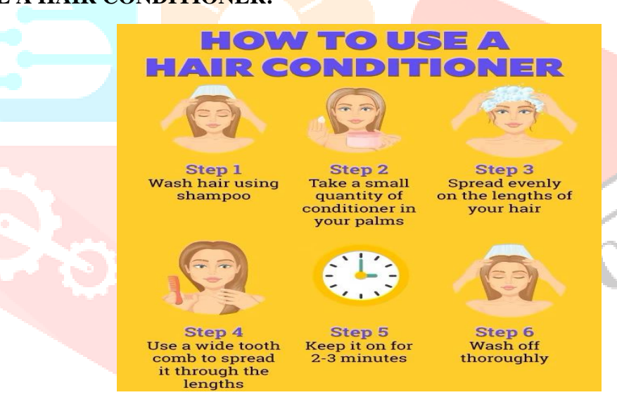
FIG.3. HOW TO USE HAIR CONDITIONER