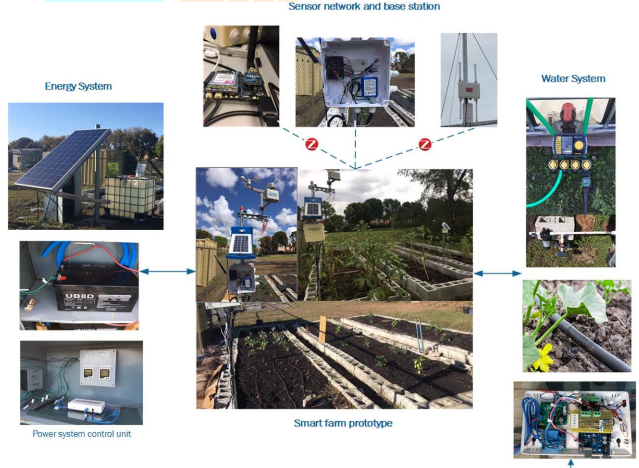
Irrigation control unit

Depending on the kind of farming being done, smart agriculture may or may not be implemented. Many embedded sensors, GPS-equipped smart tractors, and other farm vehicles are used in large-scale agricultural settings. Real-time data transmission is already possible through the use of data visualisation tools. In this context, where integrated sensors offer various forms of aerial imagery, field survey, and position mapping, drones play a major role.5 Spatially enabled mobile sensing technologies are being used in small- to medium-sized arable farming to give detailed analyses of field conditions in various soil layers, nutrient levels, and overall ambient environmental conditions.