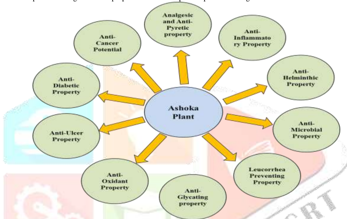
Figure 2- Various medicinal properties of Ashoka plant

Ashoka, particularly its bark and leaves, has a variety of therapeutic advantages. Women who suffer heavy, irregular, or painful menstruation may gain relief from treatment with Ashoka for a variety of gynecologic and menstrual disorders. To relieve discomfort in the stomach and muscle spasms it may be taken two times daily after meals in either the form of powder or tablet. Because of their blood-purifying properties, Ashoka bark juice may also promote good skin. In brief, Ashoka show multiple pharmacokinetic properties. Multiple interesting medicinal properties of Ashoka plant is provided in figure 2.