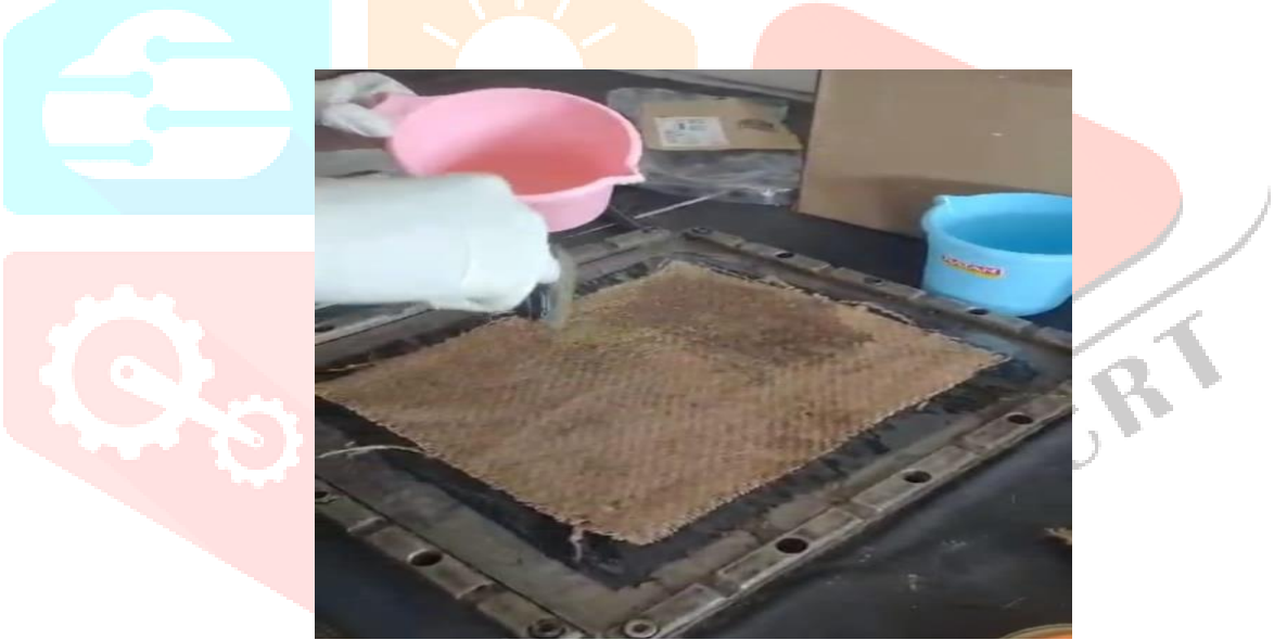
(Applying resin on jute fiber, below the jute consists of carbon fiber) Figure 1: Hand layup process

[10] Trimming and Finishing: Trim any excess material and clean up the edges of the cured composite part using appropriate tools. Additional finishing processes, such as sanding, polishing, or painting, may be performed depending on the desired final appearance and requirements.