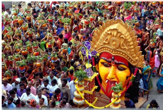
Bonalu Jatara at Secundrabad

The ritual of offering bonam, a meal in earthen pots, is a testament to the festival's profound symbolism. It serves as a reminder of the values of gratitude and togetherness, as well as the importance of sharing one's blessings with others 3 . This act of offering extends beyond the physical meal; it signifies the sharing of joy, the binding of hearts, and the nurturing of relationships. It reflects the essence of a culture deeply rooted in communal bonds and a sense of responsibility towards one another.