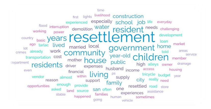
Figure 8. Word Cloud

Additionally, 10% (3 responders) of the participants from the five (5) resettlement villages gave neutral answers to the interview's main topics. These people who have moved or who are on the master list for Community Mortgage Program (CMP) recipients maintained by the housing division of the city government of Tarlac indicate satisfaction with their present communities of resettlement. However, they have certain expectations from the local government in terms of livelihood opportunities and financial assistance, as well as improvements in the conditions of their current homes.