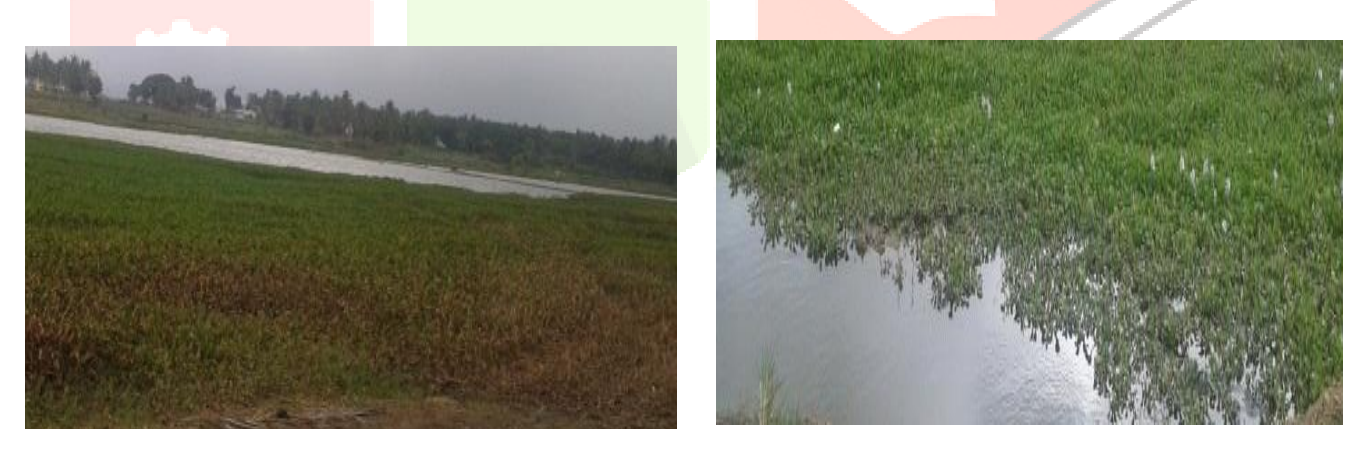
Fig 1: A view of Dantaramakki and Hiremagalur Pond

Water temperature and pH were recorded at the sampling spot itself and the estimation of other physicochemical parameters like, DO (Dissolved oxygen), free CO<sub>2</sub>, hardness, alkalinity, chlorides as given by the standard procedures (Trivedy and Goel, 1986; APHA, 1998). Temperature was determined using the mercury thermometer while, pH was measured by a digital pH meter. Samples for dissolved oxygen demand were sampled with a 250mL dark colored reagent bottles. These water samples were fixed at site by Winkler's solution (MnSO<sub>4</sub>, H<sub>2</sub>O). All samples were then taken to laboratory for further determination. DO was then determined on the fixed sample by titration. Alkalinity was determined by titration procedure where a known volume of water samples was titrated with 0.02M HCl. Total hardness of water was measured by titrating 0.01Nethylene diamine tetra acetic acid (EDTA) using Eriochrome Black-T indicator. Chloride was determined by titration procedure where a known volume of water samples was titrated with 0.014N of AgNO<sub>3</sub>. Free CO<sub>2</sub> inwater samples was determined using 0.1N Na<sub>2</sub>CO<sub>3</sub>. (Basavaraj Simpi et al, 2011).