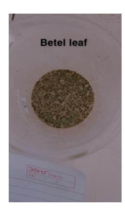
[Figure No.1.2] [Betel leaf powder]

2.1.6 Extraction procedure: (ethanolic extraction) [refer Fig.no.1.2, 1.3, 1,4] 10gm of dry powdered was extracted with the aid of using 150 ml of ethanol (70%). Potions of 1:15 of dried powdered as well as solvents were selected for Soxhlet extraction process. The process was run for 4-5 hours at 50 degrees Celsius.