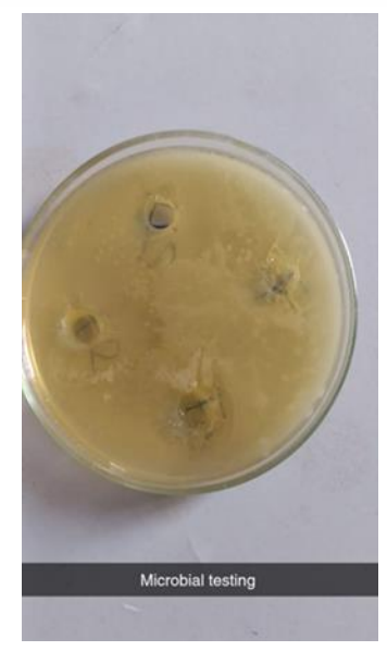
[Figure No.4.3] [microbial testing]