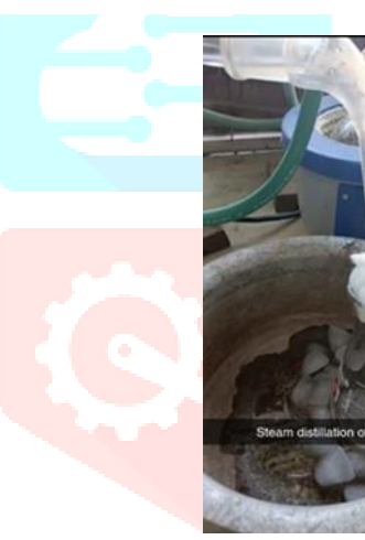
[Figure No.2.2] [Steam distillation of lemongrass]