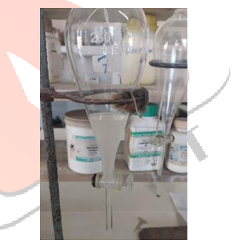
[Figure No.2.3] [Separating Funnel]

2)Solvent extraction3)Hydro distillation