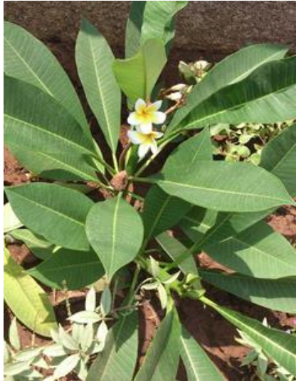
English Name: Pagoda tree Malayalam Name: Alari