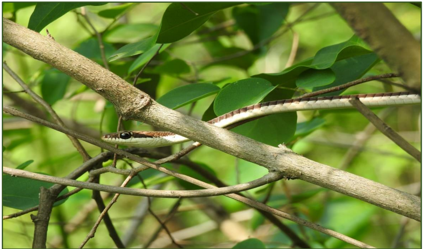
Fig 4. Hanging from a branch of tree (Dendelaphis tristis)

and clearly broader than the neck [Fig 5]. Upper lip yellowish-white and ventral scales sharply folded upwards. Color is yellowish-white or greenish-white which extends to first two dorsal rows. Sub caudal scales with olive tint of yellow or brown color. Have a very long and thin tail of bronze, brown or blackishbrown color which ends in a pointed tip. Sub caudal scales paired in a zigzag manner. This characteristic is found only in this particular species of Bronze-back and quite helpful during identification. Have large eyes with rounded pupils. Tongue color is bluish-gray [Fig 6].