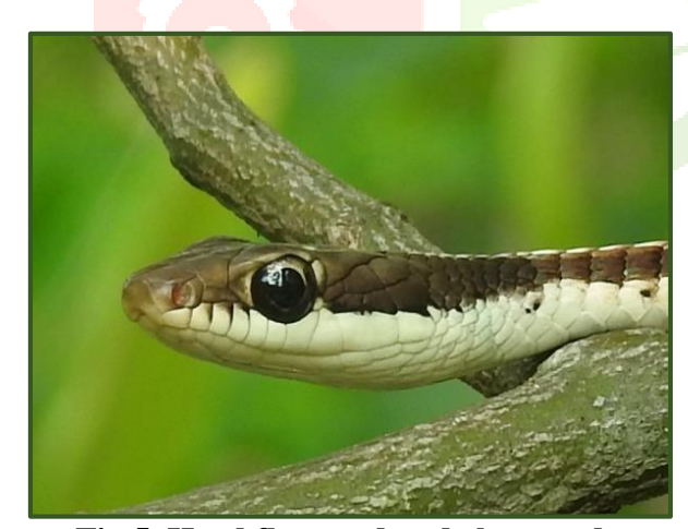
Fig 5. Head flattened and elongated