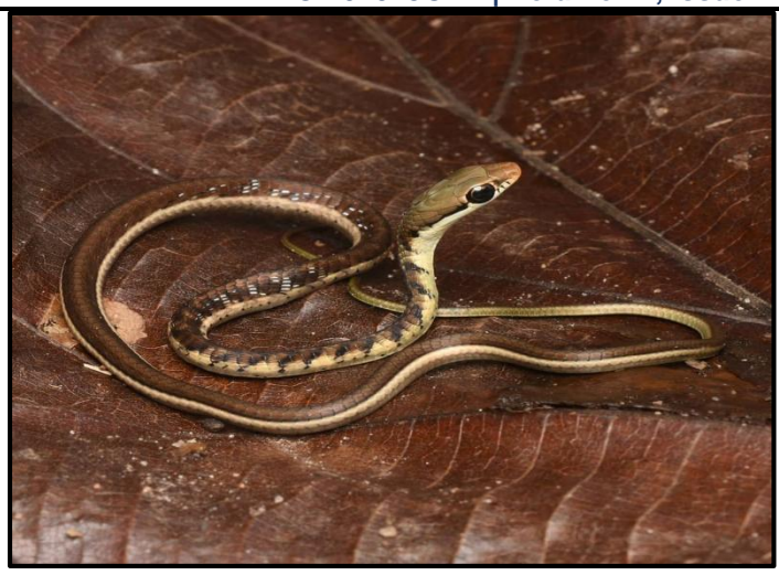
Fig 7. Dendrelaphis tristis (Bronze back tree snake)