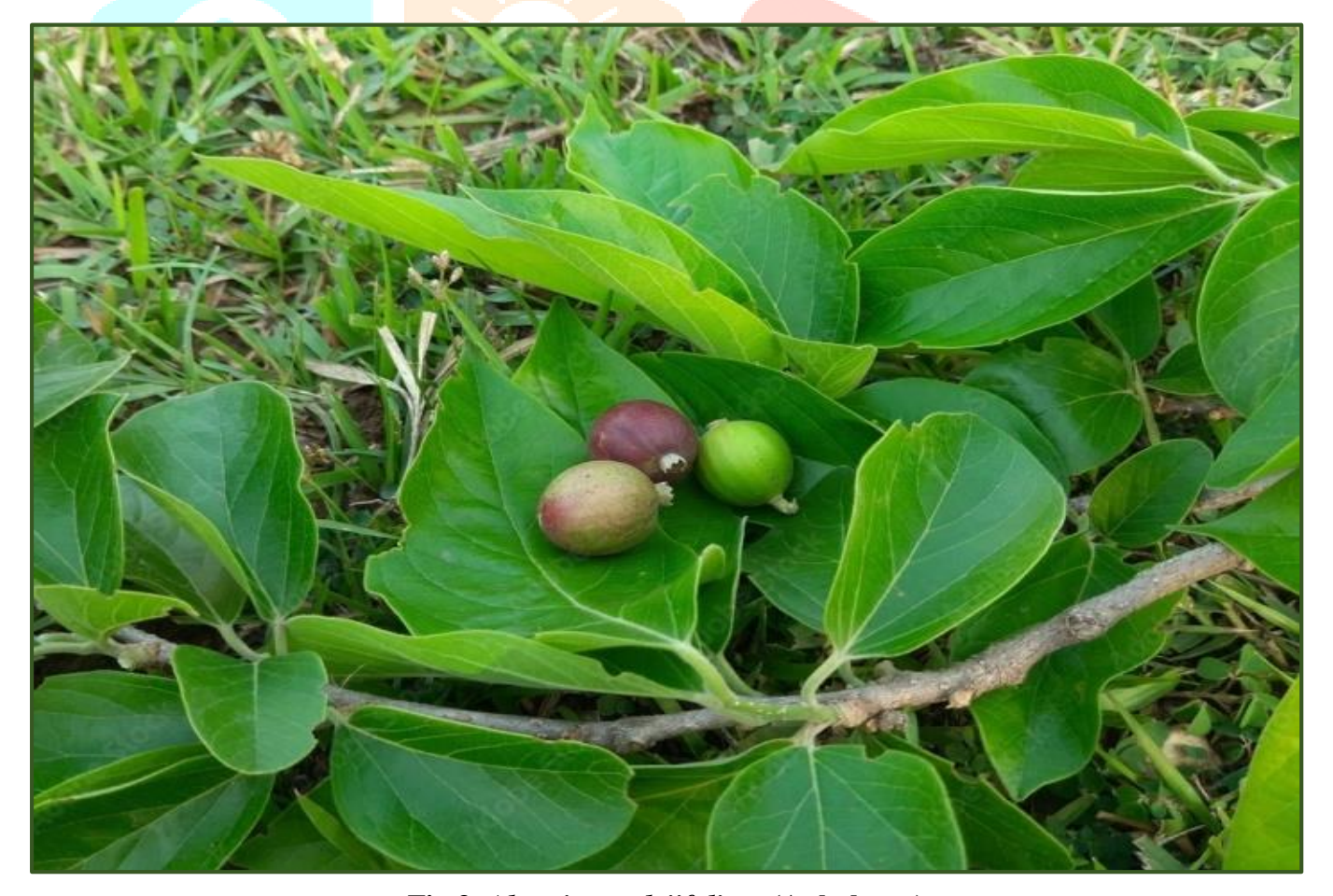
Fig 3. Alangium salviifolium (Ankol tree)