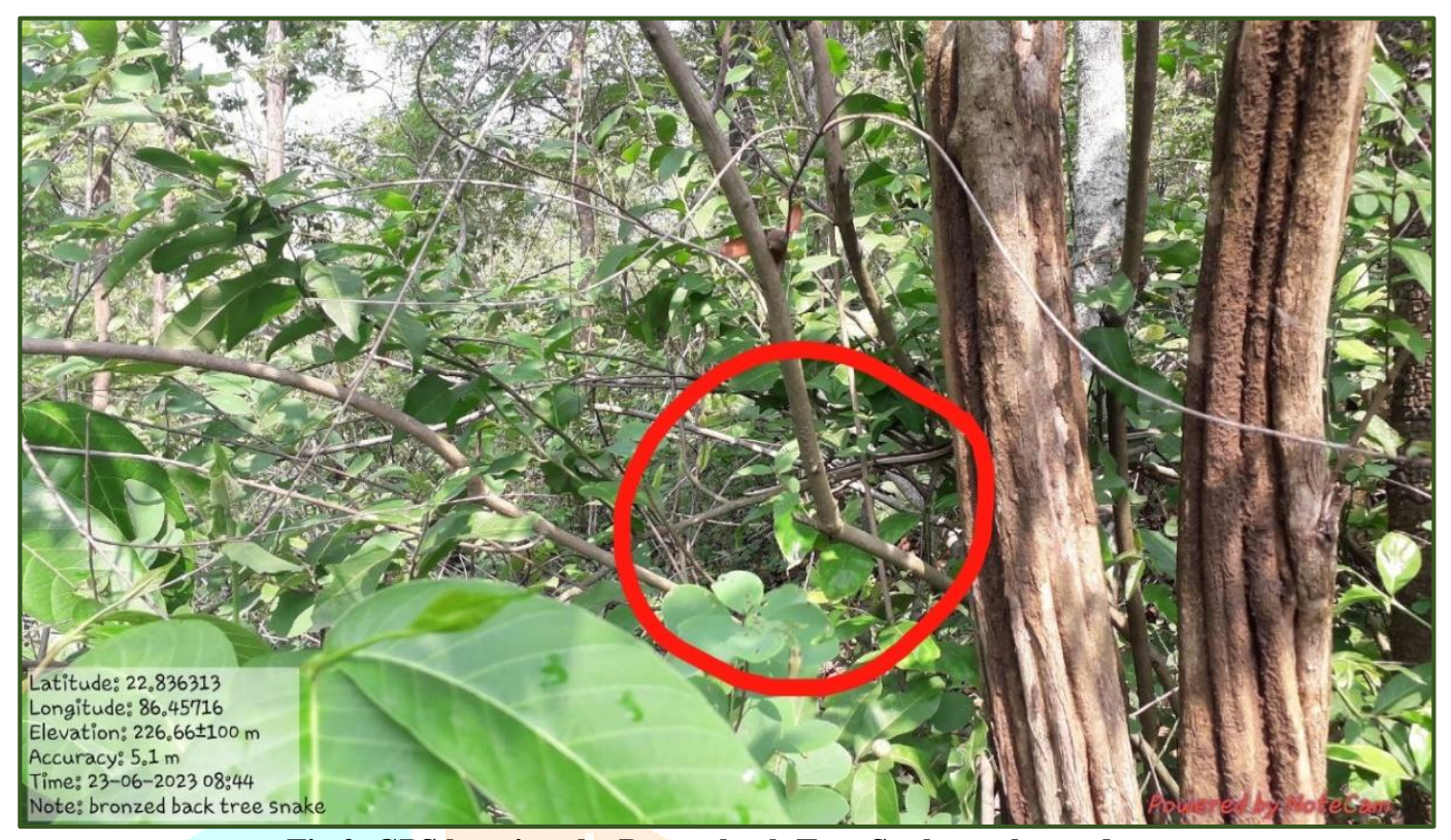
Fig 2. GPS location the Bronzeback Tree Snake at the study area