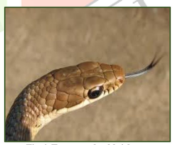
Fig 6. Tongue color bluish-gray.