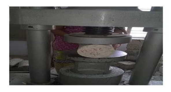
Fig.4.1.split tensile strength test.

Two certainly one of a kind coarse aggregate sizes (20mm and 10mm) had been used from the identical deliver. Maximum length of 20mm is typically used in creation initiatives in Japan. Aggregate with most duration of 10mm become used to understand the behaviour.