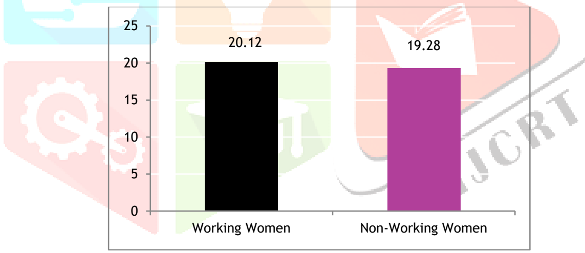
Figure – 1: Means Scores of Working and Non-Working Married Women on Marital Adjustment.

Table -1 shows the comparison scores of working and non-working married women on marital adjustment, which shows that there is no significant difference between working and non-working married women with regard to marital adjustment (df = 98, t = 1.17, p = Not Significant). This finding do not support our hypotheses that working married women and non-working married women differ from each other on marital adjustment.