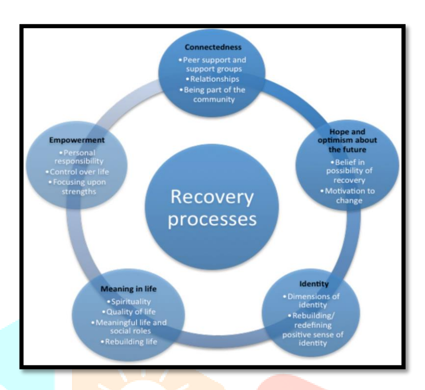
Figure 4: Theory of mental health recovery