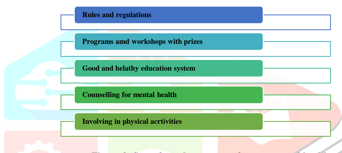
Figure 3: Steps for enhancement of young mental health