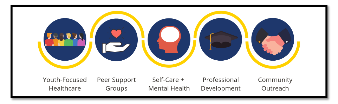
Figure 2: Young adult health circle of care