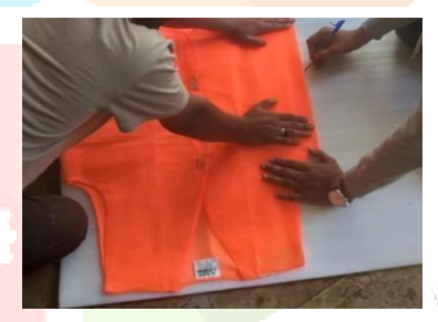
Fig: Marking of the Foam Sheet