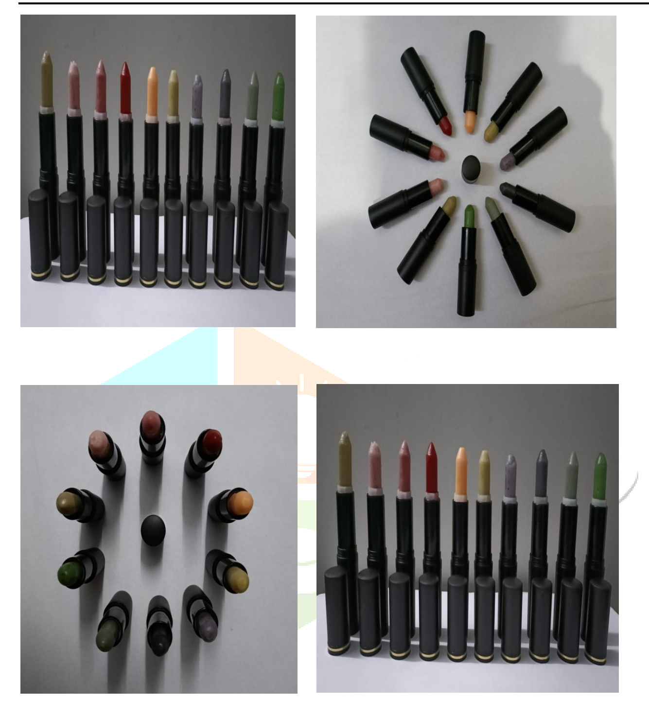
Figure No: 4 Formulation Of Pigments Containing Lipsticks