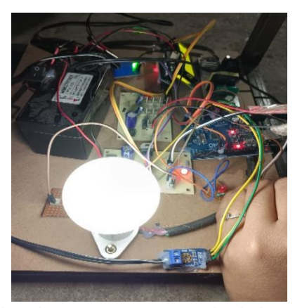
Fig 4. When the LDR sensor senses the darkness the bulb glows

Figure 3 displays the observations such that when the LDR sensor senses the light in the environment it allows the bulb to turnoff by using the stored energy in the battery.