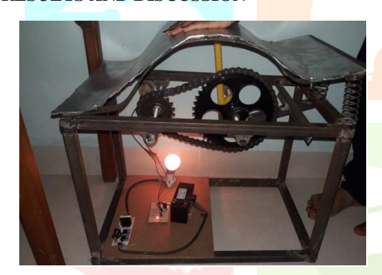
Fig 2. Rack pinion mechanism prototype

Figure 2 displays when a vehicle passes over the speed breaker it compresses downwards in vertical motion enabling the start of the rack and pinion mechanism, which we demonstrated that by pushing the speed breaker with our hands. During this when the pressure is applied the springs that are attached to the speed breaker compress enabling the pinion to move down which further rotates the rack, which produces rotational energy. This produced rotational energy is passed to a chain sprocket whose functioning is explained in the working thus enabling the gears to rotate that is further connected to the generator which converts the rotational energy into electrical energy and it is passed to the battery to get charged through a charging circuit. The Arduino microcontroller used can be effectively controlled the system, detecting the motion of the speed breaker using sensors, controlling the generator, rectifier, and charge controller, and calculating the battery capacity and is displayed in LCD for getting to know when the battery capacity is low and can be used as an indication for us.