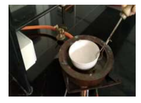
Preparation Oil Phase