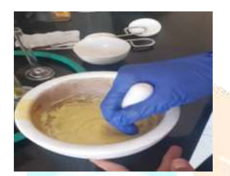
Mixing of cream