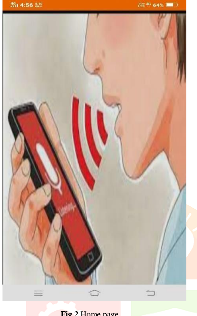
Fig.2 Home page

Figures 2 to 15 represents the sample screenshots