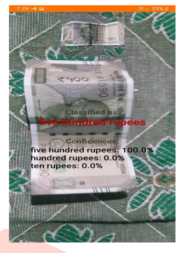
Fig.7 Currency Detection