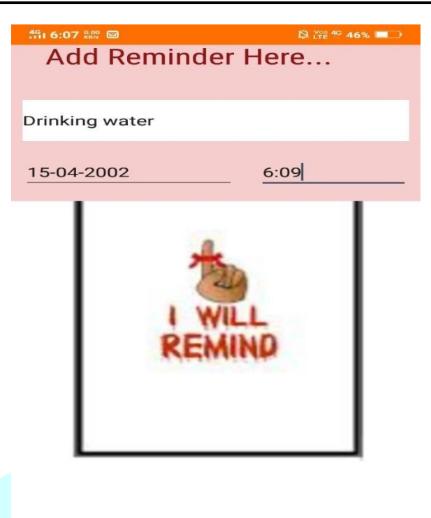
Fig.10 Message reading