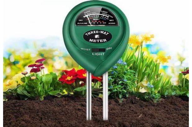
Fig .9 pH Sensor

A pH sensor determines the alkalinity or acidity of a solution. METTLER TOLEDO offers a broad portfolio of pH sensors for various industries, such as pharmaceutical, chemical, food and beverage, energy, and semiconductor, as well as for water and wastewater treatment. Whether you need a pH sensor in the laboratory or for in-line use, we have suitable sensors that meet all your application requirements.