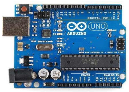
Fig. 2 Microprocessor-ARDUINO

was chosen to mark the release of Arduino Software (IDE) 1.0. The Uno board and version 1.0 of Arduino Software (IDE) were the reference versions of Arduino, now evolved to newer releases. The Uno board is the first in a series of USB Arduino boards, and the reference model for the Arduino platform; for an extensive list of current, past or outdated boards see the Arduino index of boards. The 5.1 figure illustrate the picture and components of Arduino.