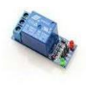
Fig. 4 Relay

distance telegraph circuits as amplifiers: they repeated the signal coming in from one circuit and re-transmitted it on another circuit. Relays were used extensively in telephone exchanges and early computers to perform logical operations.