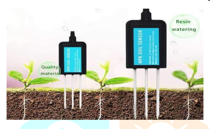
Fig .7 NPK Sensor

The soil NPK sensor is suitable for detecting the content of nitrogen, phosphorus, and potassium in the soil, and judging the fertility of the soil. Thereby facilitating the systematic evaluation of the soil condition. Can be buried in the soil for a long time, resistant to long-term electrolysis, corrosion resistance, vacuum potting, and completely waterproof. Soil NPK sensors are widely used in soil nitrogen, phosphorus and potassium detection, precision agriculture, forestry, soil research, geological prospecting, plant cultivation and other fields.