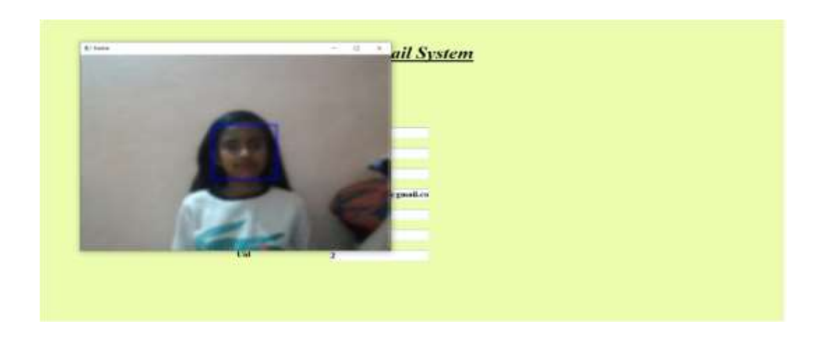
Figure.3. Face Authentication Page

This is the registration page where the user provides the following information from a voice command to sign up for an account .