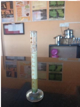
8.2 Foaming ability and foam stability

foam ability was determined by using measuring cylinder shake method brittle 3 ml of the formulation soap solution was placed in cylinder it was covered with a hand and shaken the total volume of the foam content after 1 min of shaking recovered foam stability was evaluated by recording the foam height after 1 min and 4min is 09 to 10.