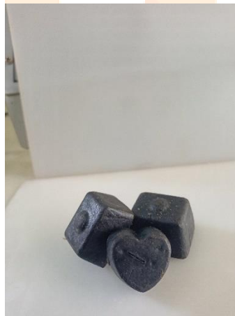
Fig-7.5 final product(shampoo bar)