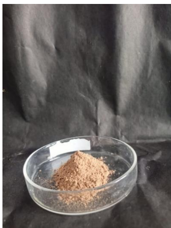
Figure no 4.4 Reetha