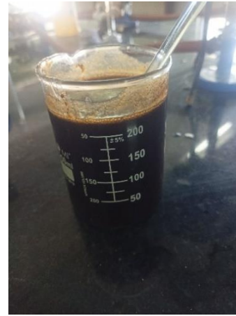
Fig-7.3 Mixture C