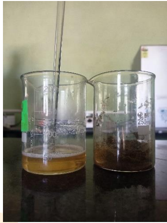
Fig-7.2 Mixture A & B