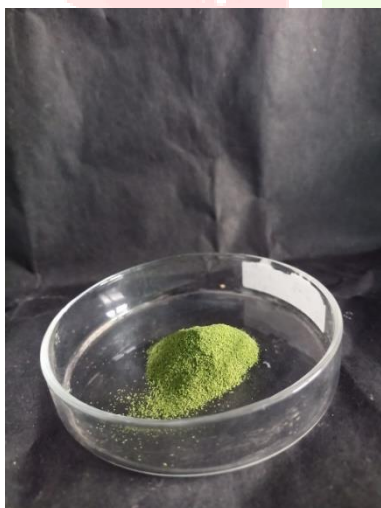
Figure no 4.3 Neem

Biological sources: It consists of leaves and other aerial parts of Azadirachta indica.