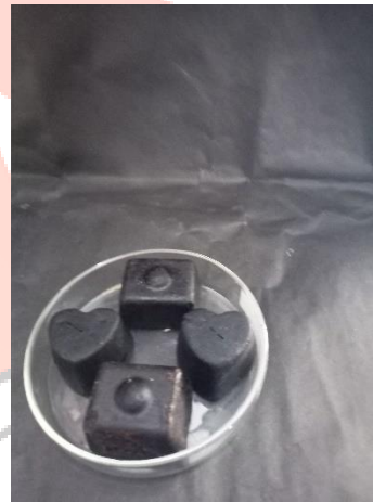
Fig-7.6 shapes of shampoo bar