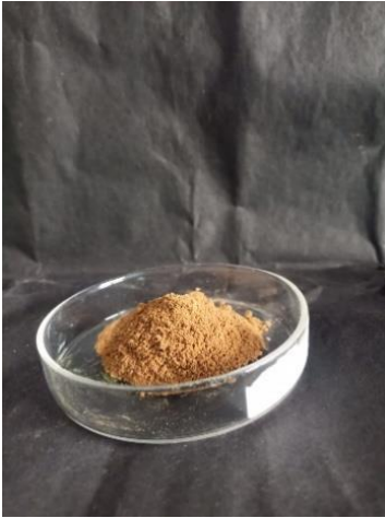
Figure no 4.1 Shikakai