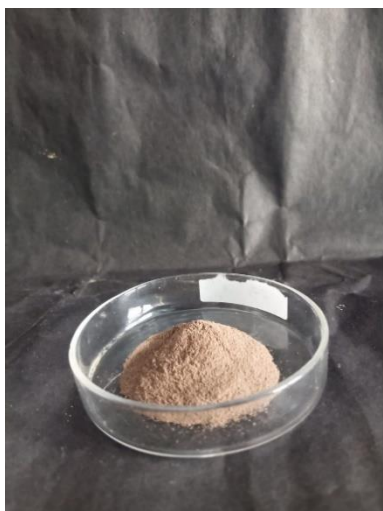
Figure no 4.2 Amla