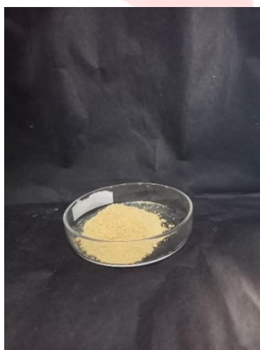
Figure no 4.5 Fenugreek