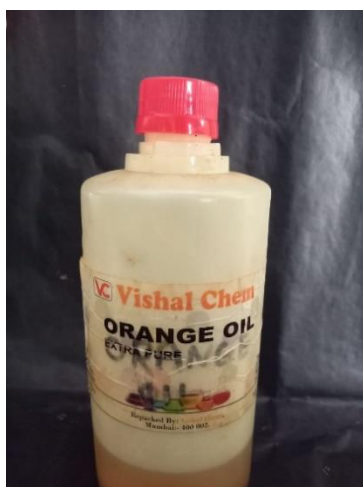
Figure no 4.7 Orange Oil

Biological Source: -Extracted from the rind of the sweet orange citrus sinensis