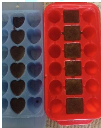
Fig-7.4 Poured into soap mould