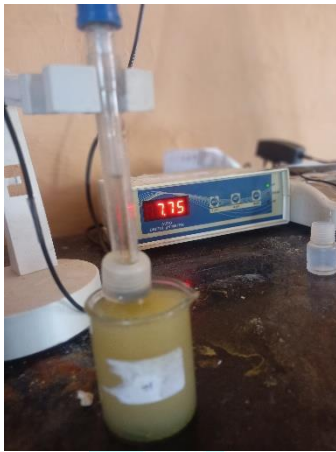
8.1 Determination of PH

5 to 6 ml of the soap was weighed accurately in a 100 ml beaker 40 ml water was added and dispersed the soap in it. The ph of the solution is determined by using digital ph meter. Ph of soap is 7-9