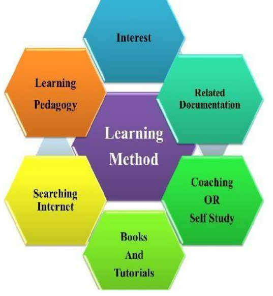
Figure 1.2 Java Learning Method

Books and Tutorials : A book that gives guideline in a specific range. Instructional exercise is a time of escalated educational cost given by a mentor to an individual understudy.