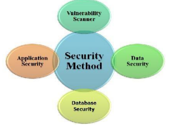
Figure 1.5 Java Security Method

Java Security Method: In this day and age where PC organizing assumes a vital part in the regular day to day existence, PC lawbreakers cause destruction in basic or vital system conditions. A typical criminal exercise includes: tapping system movement, altering databases, adjusting sites crippling administrations and data robbery.