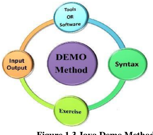
Figure 1.3 Java Demo Method

Java Demo Method: Demo, (e.g. Demonstration) includes appearing by reason or impenetrable, clarifying or clarifying by utilization of cases or trials. Put all the more essential, exhibition intends to unmistakably appear. In educating through the exhibition, presentation understudies are set up to possibly conceptualize class material all the more adequately as appeared in a review which particularly concentrates on Java Programming Language demonstrations and all the concept of operating java performance..