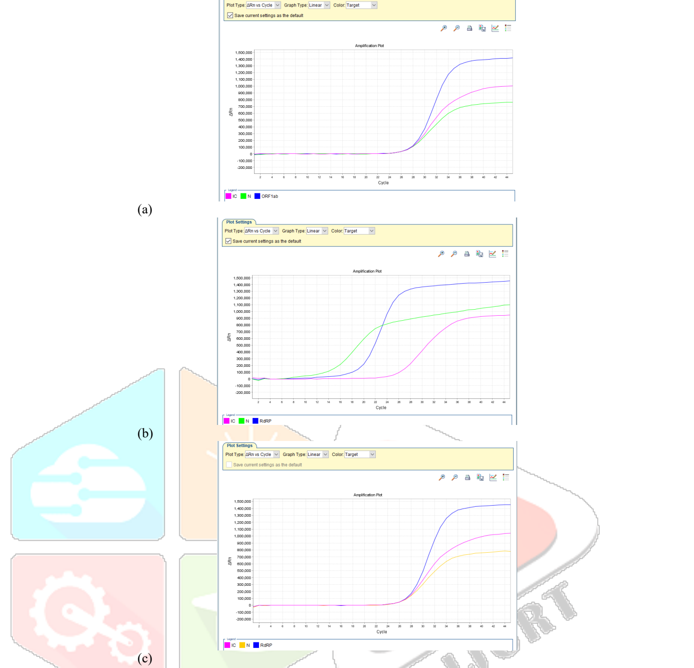
Plate (1). Amplification curves (a) RT-PCR shows ORF1ab gene (Ct=29), Nucleocapsid gene (Ct=29) and Internal control gene (Ct=29) targets, (b) RT-LAMP show RdRp gene (Ct=20), Nucleocapsid gene (Ct=17) and Internal control gene (Ct=28) targets and (c) Dry swab method show RdRp gene (Ct=28), Nucleocapsid gene (Ct=28) and Internal control gene (Ct=28) targets